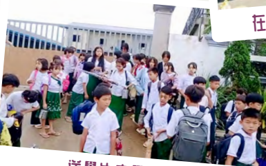
送學生去學校讀緬文